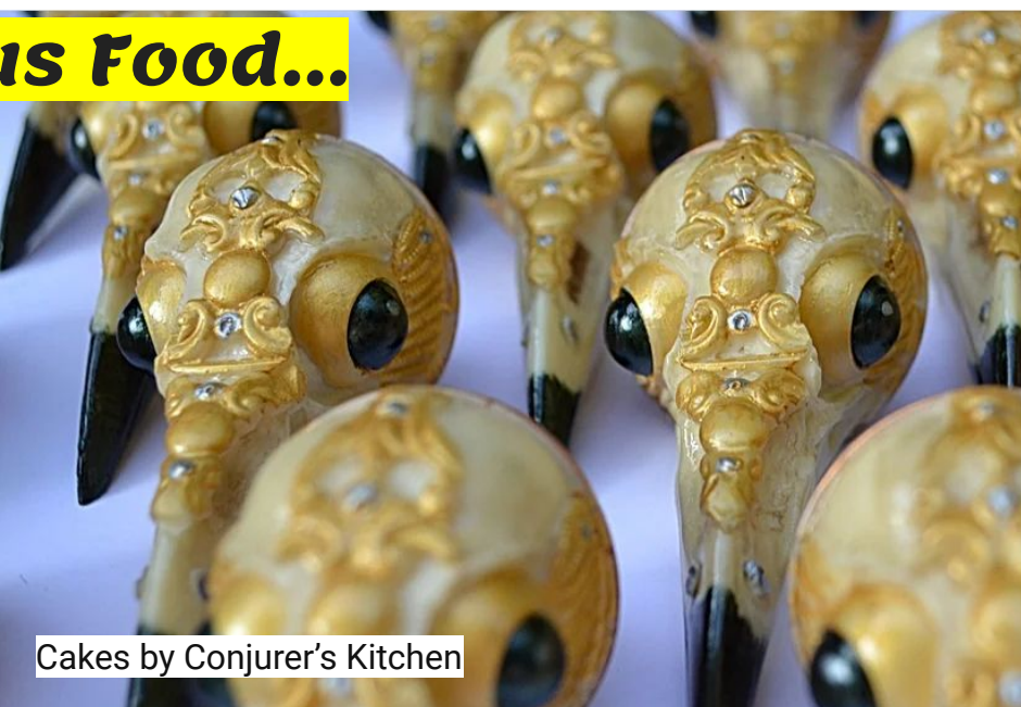
Cakes by Conjuror's Kitchen