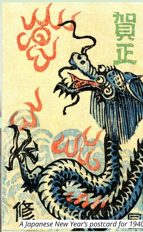
A Japanese New Year's postcard for 1940,