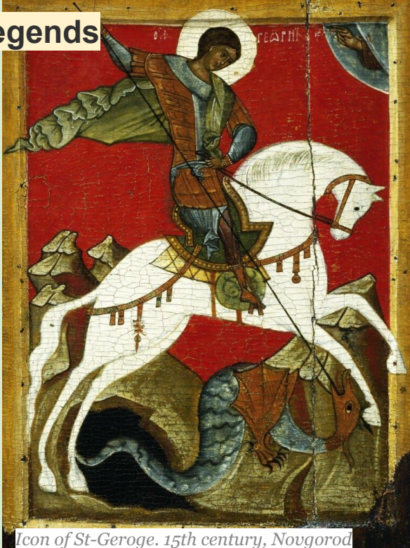
Icon of St-Geroge. 15th century, Novgorod