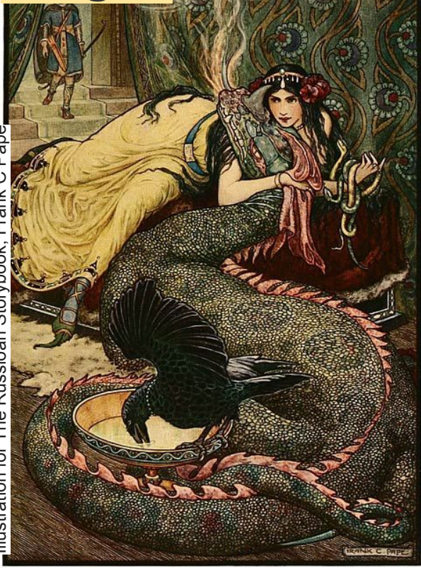
Illustration for The Russian Storybook, Frank C Pape