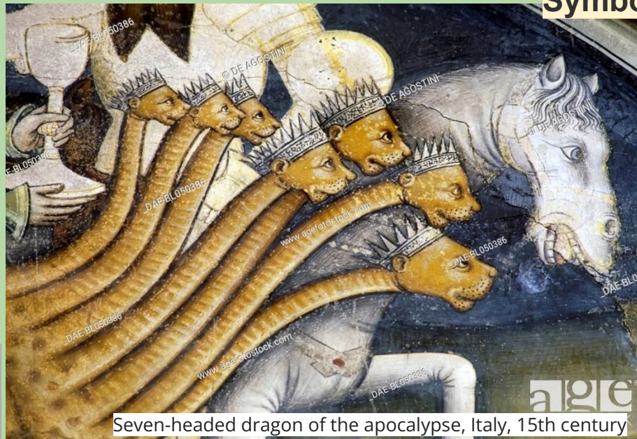
Seven-headed dragon of the apocalypse, Italy, 15th century