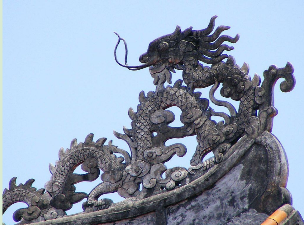
Dragon roof feature in the Imperial City, Hué, Vietnam