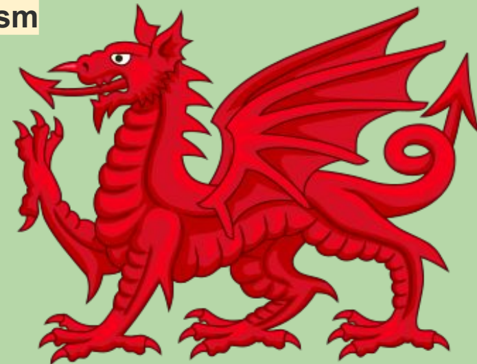
In the ancient Welsh story of Ludd and Llefelys the red dragon symbolises the Celtic Britons and the white dragon the invading Anglo Saxons.